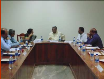
BoG Meeting at College conference hall