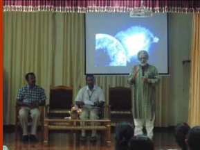
SPACE WEEK CELEBRATION