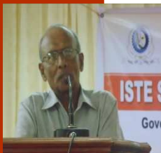
Senior Research Advisor's Visit